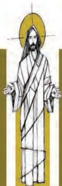
Colors of the Easter Season

Any other packaged or canned food items or toiletries are gratefully accepted. Thank you so much for your continued generosity.