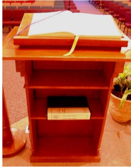
Photo 7. Ambo with Weekday Lectionary and weekday Prayer of the Faithful binder.