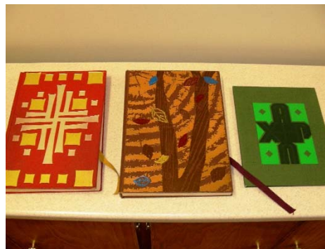
Photo 6. Book of the Gospels, Lectionary book and Prayer of the Faithful folder for use during weekend and Feast Day liturgies.