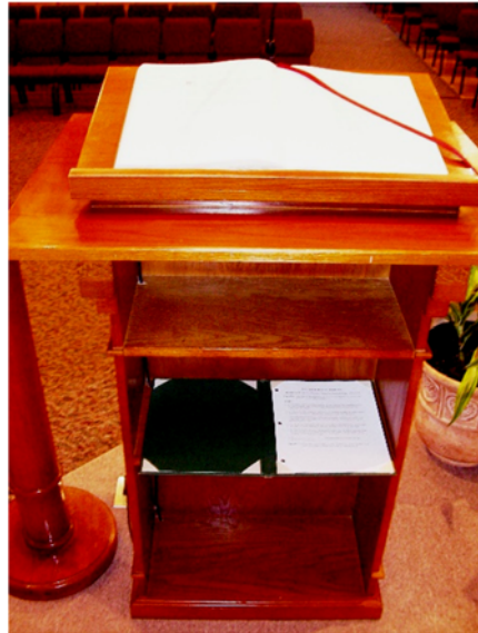
Photo 5. Ambo with Lectionary book and Prayer of the Faithful folder in place for weekend liturgies.