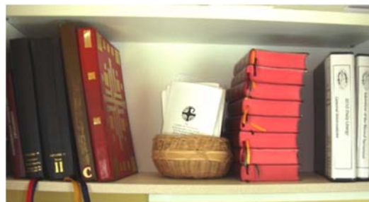
Photo 9. Lectionary Books. Stored behind the altar wall in the upper, left cupboard..