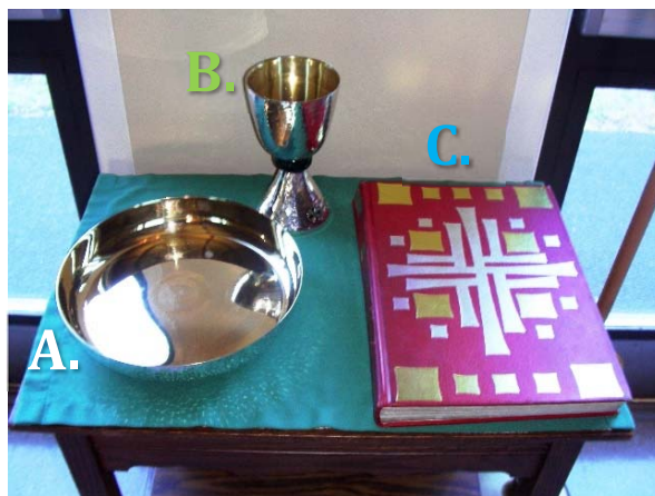
Photo 2. Presentation Table at the rear of the center aisle.