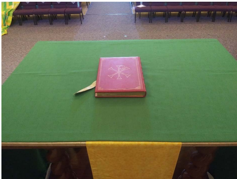
Photo 4. Lector 2 carries the Book of the Gospels in the Entrance Procession, takes it up the right-hand stairway, and places it face down in the middle of the altar at the beginning of the weekend liturgy.