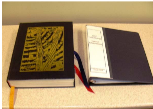
Photo 8. Weekday Lectionary Book and weekday Prayer of the Faithful binder.